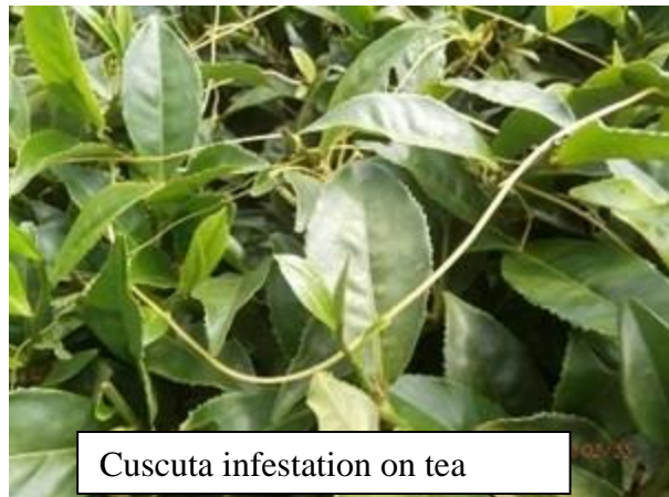
Cuscuta infestation on tea