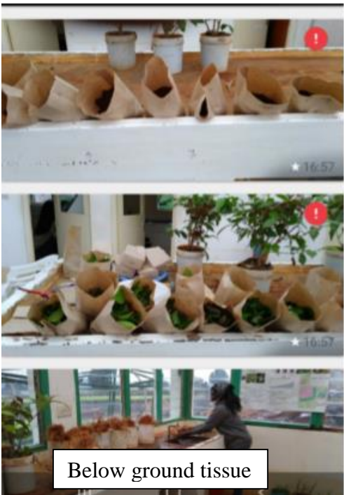
Below ground tissue