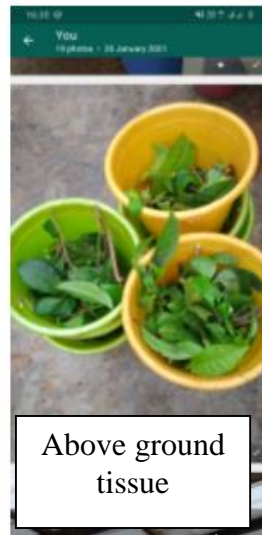
Above ground tissue