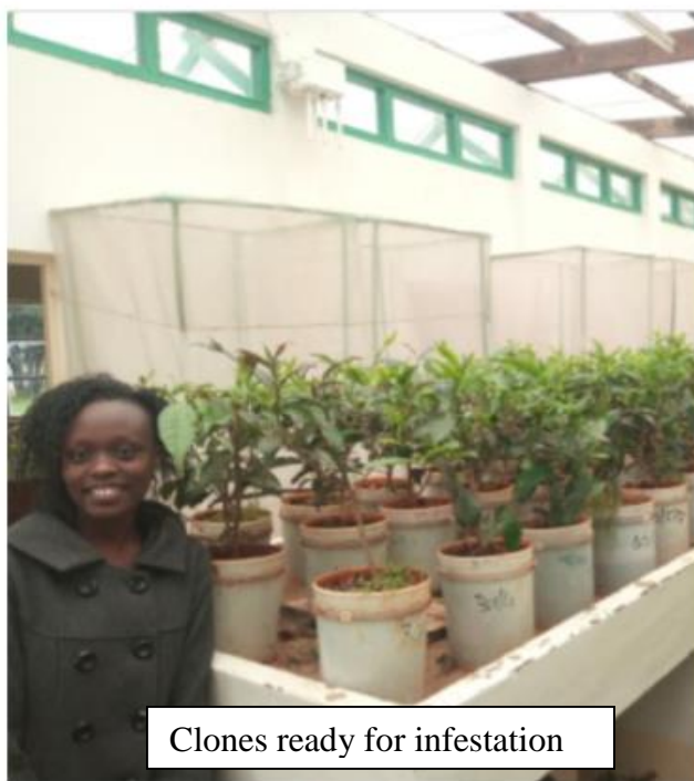
Clones ready for infestation