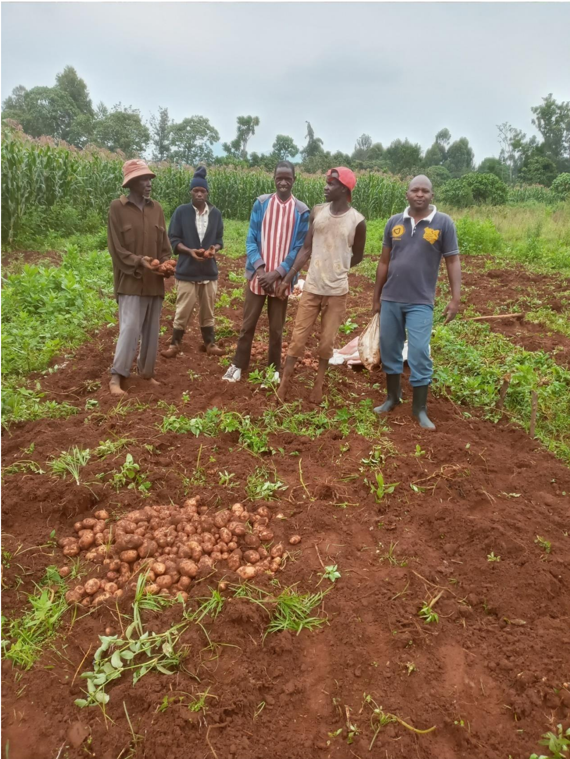
Figure 3 Display of potatoes tubers during harvesting 99 days from planting date.

Figure 3 are display of potato tubers during harvesting two week after dehauling.