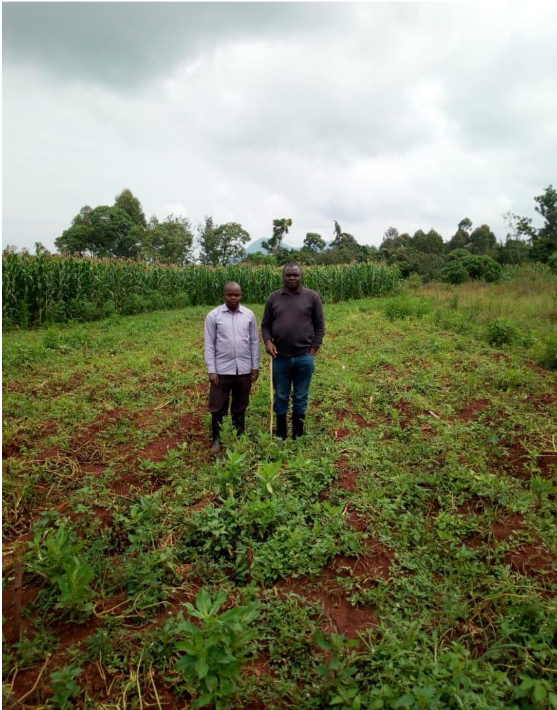
Figure 2 Display of potatoes 89 days after planting when the tubers were ready to be harvested.

Figure 2 are display of potatoes plants 89 days after planting and two days after cutting the aerial part of the plant. The tubers are ready to be harvested.