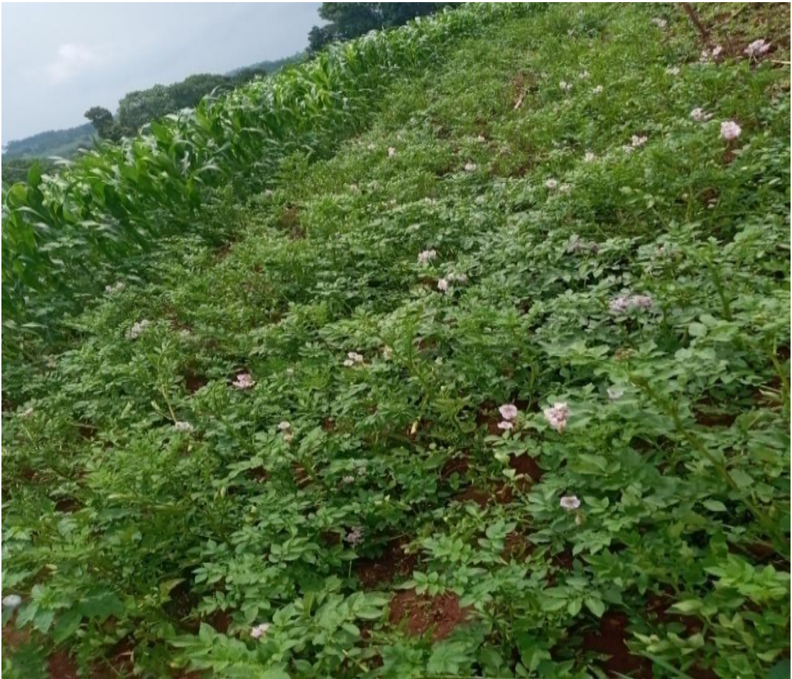
Figure 1 Displays of potatoes 53 days after planting when the potatoes starts to bloom

Figure 1 are display of potatoes plants 53 days after planting and one week after weeding and ridging.