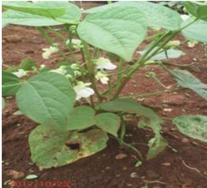
Figure 3. White flower colour.

resistance and tolerance. The bracteolate size classification in the study therefore had significance in association with anthracnose resistance.