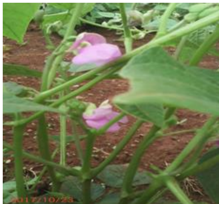
Figure 2. Purple flower colour.