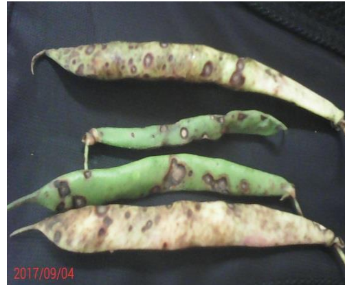
Plate 4: Bean pods infected with anthracnose

In Busia, some genotypes recorded low incidence and severity and these were; Chelalang, GLP2, GLP1127, Miezi mbili and KK15. The genotypes which had moderate incidence and severity were; KK8, Tasha and Ciankui. The high incidence and severity were realized in; RED13, Redbean16, CAL33, CAL194, GLP92, B2 and B1 genotypes ( Table 3 ).