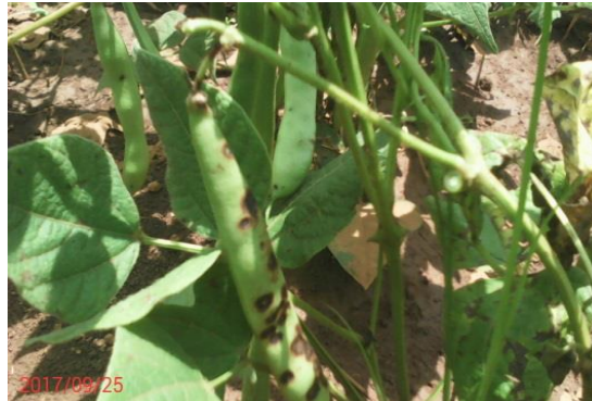
Plate 2: Bean plant infected with anthracnose