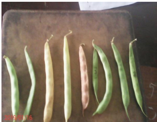
Plate 3: Healthy bean pods