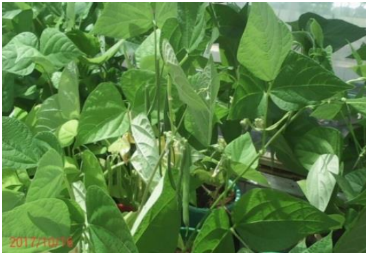
Plate 1: Healthy bean Plant

on leaves and pods of the infected common bean genotypes. Resistant common bean genotypes had healthy leaves ( Plate 1 ) and pods ( Plate 3 ). The susceptible common bean genotypes had symptoms and signs of anthracnose ( C. lindemuthianum ) on leaves ( Plate 2 ) and pods ( Plate 4 ).