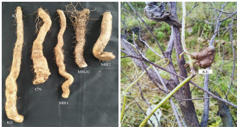
Plate 4: Harvested Tubers of the Field Grown D. schimperiana Accessions (KE, CN, MB1, MB2), control (MB2C), and D. schimperiana Bulbils Produced by Accession KE in the Field

Values with the same letter(s) in a column are not significantly different at P \leq 0.05 , according to Tukey's test.