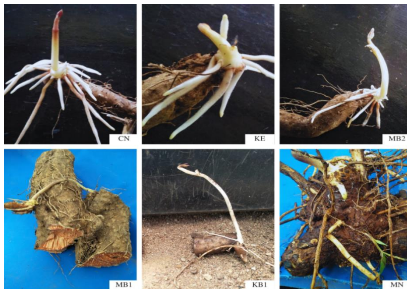
Plate 1: Sprouted yam tuber planting materials of D. schimperiana (KB1, MB1 and MB2, KE, CN) and D. alata (MN).

One month after planting, weeding and staking were carried out regularly. Each yam plant was staked using dry sticks to provide support and stimulate vine and leaf development to enhance photosynthesis. Three plants per plot were randomly sampled and tagged for data collection. Data on internode and vine length/plant, number of leaves/plant and presence or absence of bulbils/plant were recorded. The underground tubers were carefully and manually dug out, and the bulbils were picked from the vines, after the shoots had dried up. The soil was washed off the tubers. The number and fresh weight of tubers and bulbils per plant were assessed and recorded.