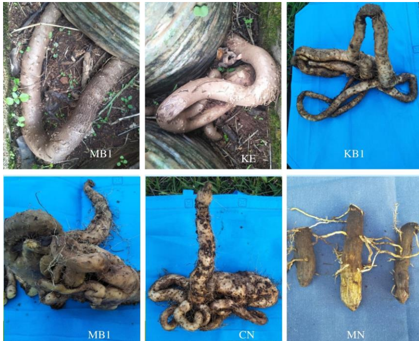
Plate 2: Extracted root tubers of net-house grown yam accessions, MB1 and KB1 (Baringo), KEa and TE (Elgeyo-Marakwet), CNa (Nandi) and MN (Nyeri)