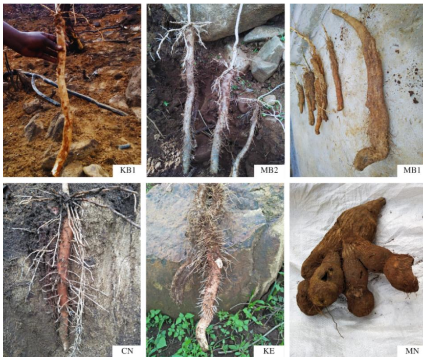
Plate 3: Wild Yam, Dioscorea schimperiana Kunth (KE1, CN, MB2, KB1 and MB1) and D. alata (MN) Underground Tubers Collected in situ