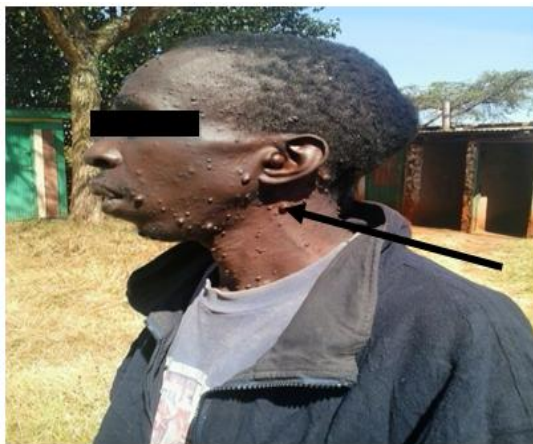
Plate 1. The Kwanza case of L. aethiopica infection showing nodules on the face and upper body (arrow)

Since Phlebotomus pedifer were caught in the peri-urban areas where Leishmania aethiopica cases were, it can be concluded that transmission is actively going on in these sites. Sand flies even though were caught in small numbers during and after the rainy season, in the same sites; the sand flies breed and rest in these sites where disease transmission takes place. It is yet to be known when transmission takes place.